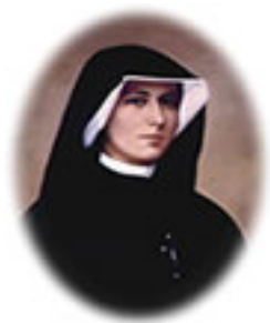
Saint Maria Faustina