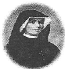
Saint Maria Faustina