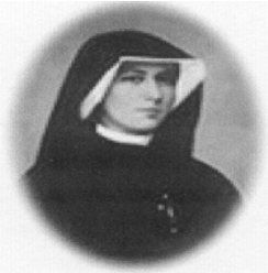
Saint Maria Faustina

The Eucharistic Apostles of The Divine Mercy (EADM) is building the body of Christ through its worldwide network of Cenacles. This guided study program for prayer communities includes the study of Sacred Scripture, the Catechism of the Catholic Church, and the DIARY of St. Faustina. Participants gather in local communities to learn more about God, the Holy Catholic Church and their place in the Body of Christ